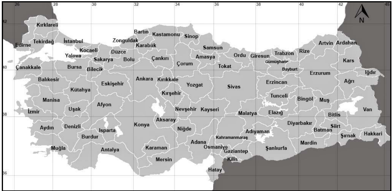
Fig. 1. Provinces of Turkey